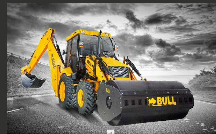
▲ Road Roller Compactor