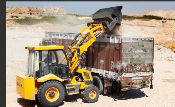
▲ Booster Bucket