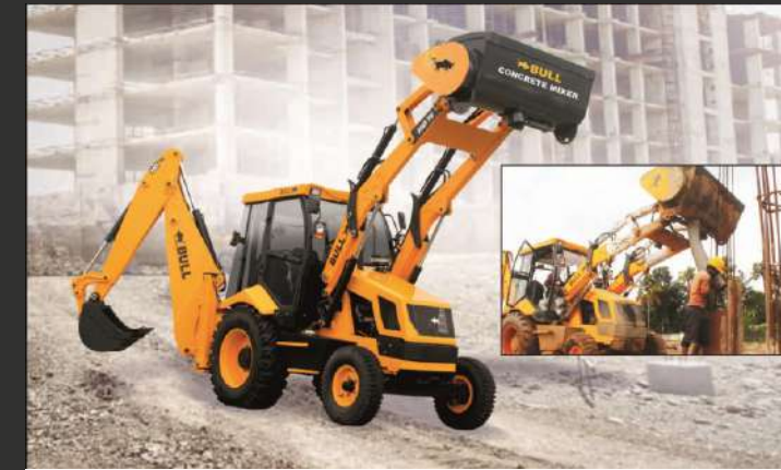
▲ Concrete Mixer