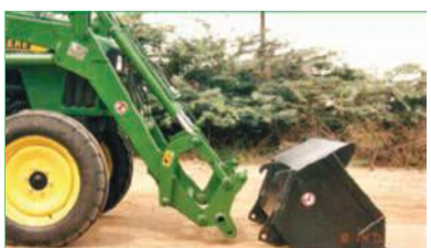
BQRSL mechanism Ease of bucket interchangeability