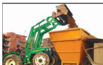
Material handling at Batching plant